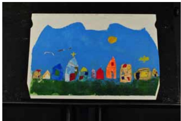
Africville scene from the ArtsSmarts Nova Scotia project, Kamishibai Theatre, which will be featured on The Scotian Project website

Plans are also underway at AGNS Yarmouth to host Estompe! an ArtsSmarts performance art/printmaking event. The title is a play on the word, estampe, which is French for print. Students will learn about music and rhythms, and work with local musicians to produce large "prints" on canvas by mark making with their feet through dance.