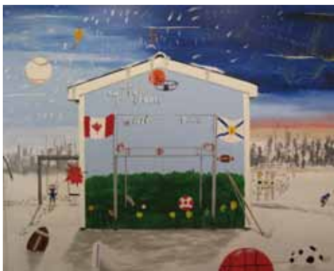
Detail from Maitland District School's mural