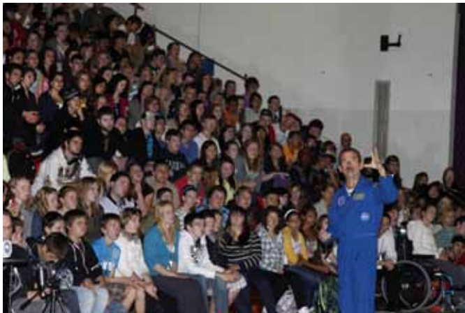
Chris Hadfield spoke to over 800 students at J. L. Ilsley High School on September 28, 2011.

The second, targeted to high school students, will focus on how to plan, launch and keep a space craft in its desired orbit. Hadfield will guide the student's avatar through their challenge to design an attitude control system for an unmanned space craft built to bring supplies to the space station. To further their understanding, the avatars will miniaturize to become elements in the fuel stream travelling through the Soyuz's combustion system and experience the powerful energy transformation that propels the vehicle forward, all the while learning how the system works.